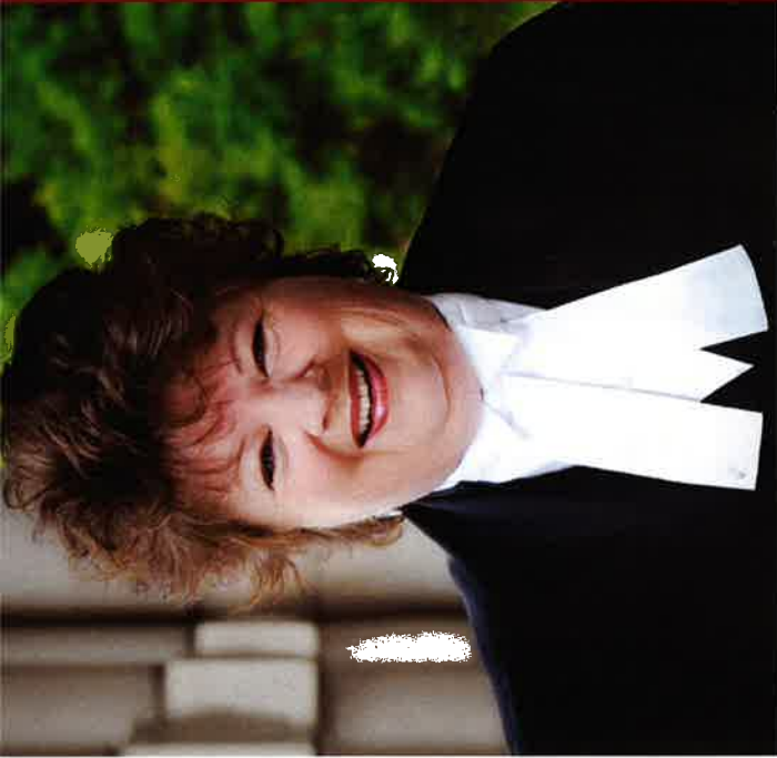
The Honourable Linda Reid, Speaker of the Legislative Assembly