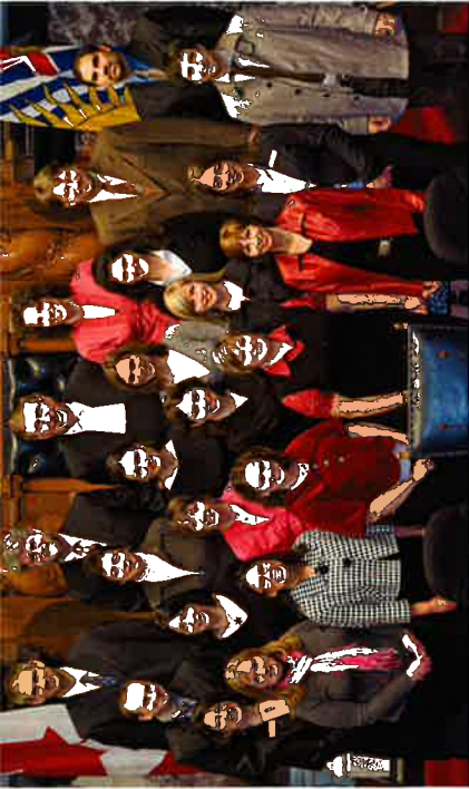
2009 BCTI Spring Institute