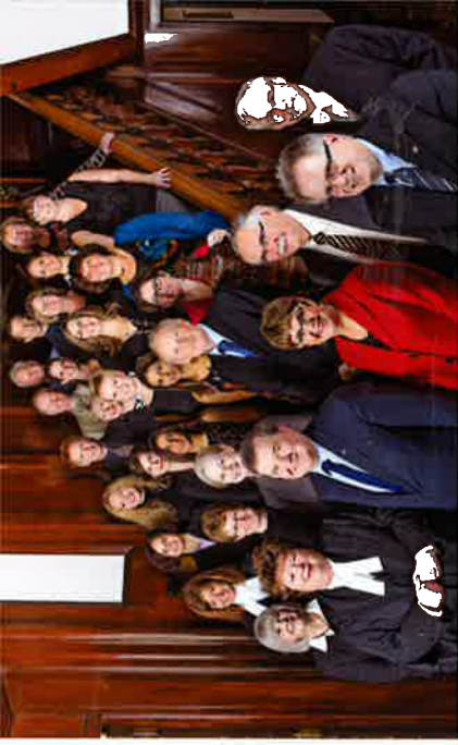
2013 BCTI Fall Institute