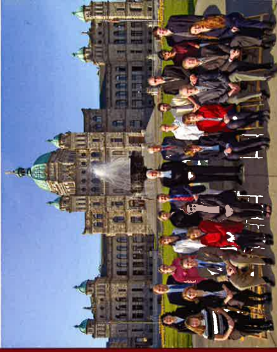
2004 BCIT Inaugural Spring Institute

The Legislative Assembly of British Columbia offers a professional development opportunity for B.C. teachers