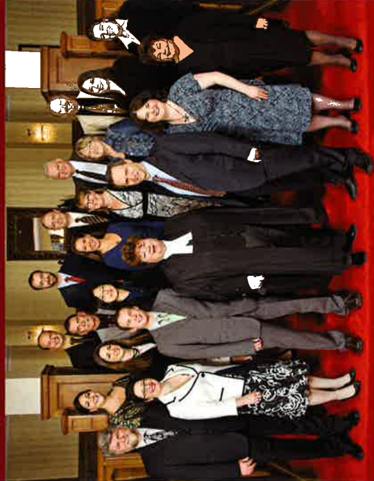
2011 BCTI Spring Institute

Please note: Attendance is mandatory at all sessions and business attire is required for most sessions